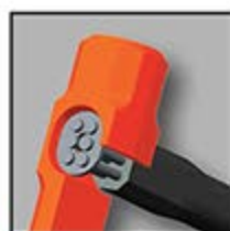
Steel Locking Plate