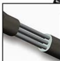
4 Spring Steel Bars