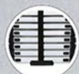
Hand Grip &amp; Velcro Storage Strap