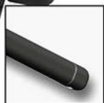
Ergonomic Rubber Grip Handle