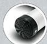
Non Slip Rubber Tipped Feet