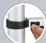
Soft Close Locking Mechanism